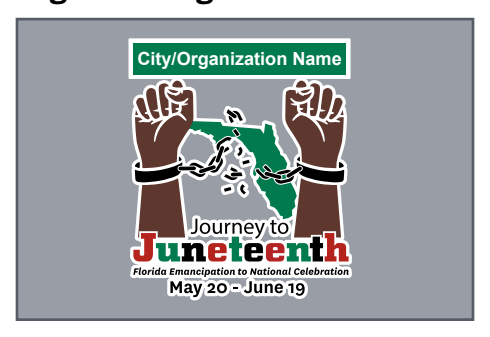
Logo without tagline outlined