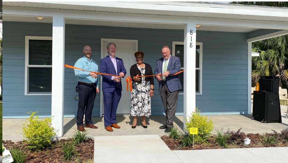
Single Family Home in Gainesville